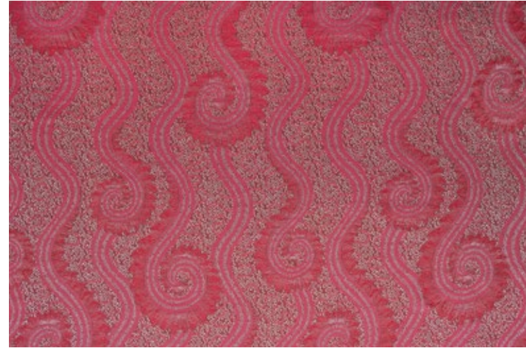
DAME ZANDRA RHODES