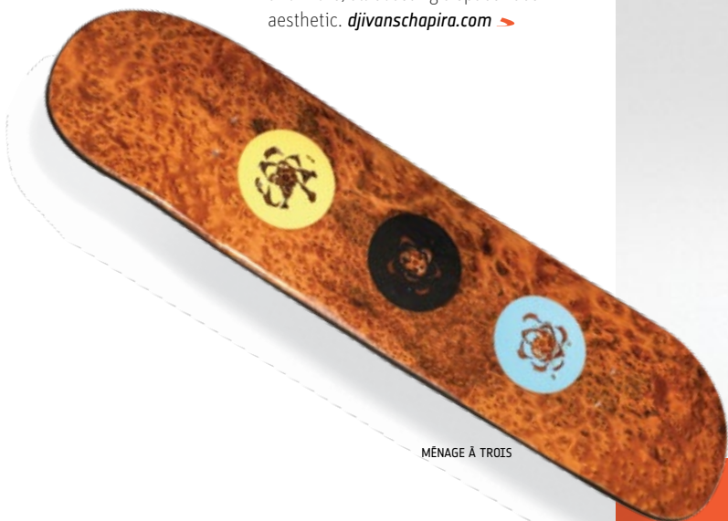
MÉNAGE À TROIS