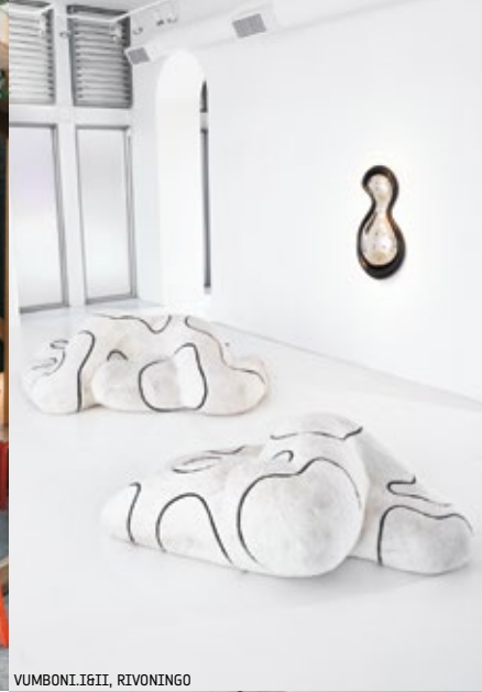
VUMBONI I&II, RIVONINGO VUTLHARI, NWA-MULAMULA